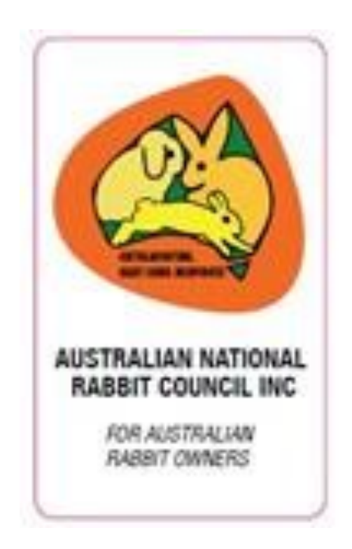
Wall Sticker $2