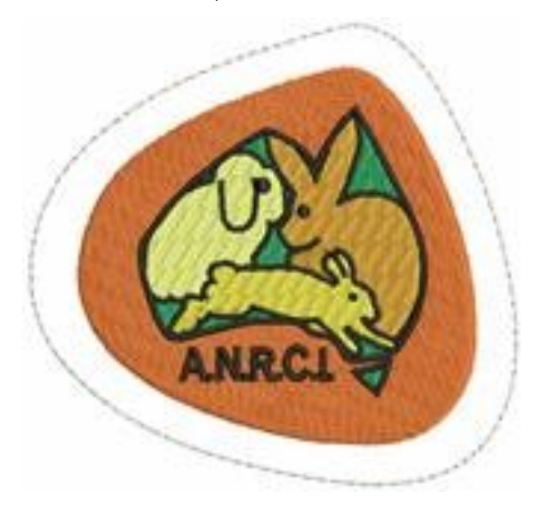
Cloth Badge $15